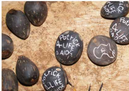
Wear your medals proudly. They were made by hand by the Lewoh Youth Association in The Republic of Cameroon, Africa for Partici-Patrick 2009.